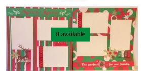
Christmas Limit #

DATE: Monday, February 29th TIME: 6:30–9 pm PLACE: Cremona CES COST: $10/PERSON + $10 FOR EACH KIT