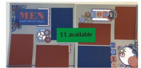
Men & Their Toys Limited #