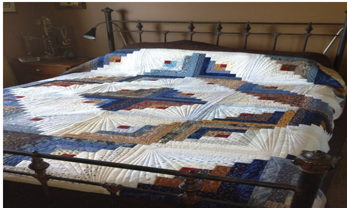
QUILT VALUE: $1500 SIZE: APPROX. 98" X 98"